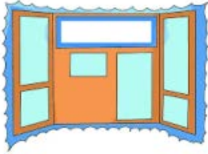
Exhibit category students should review the NHD Rule Book to ensure they do not miss any important rules and requirements for their category: NHD Rule Book .

Since all contests will be in-person, students must physically construct an exhibit to bring to the contest. Exhibit students must bring THREE printed copies of their paperwork (Title Page, Process Paper, Annotated Bibliography) to the Contest.